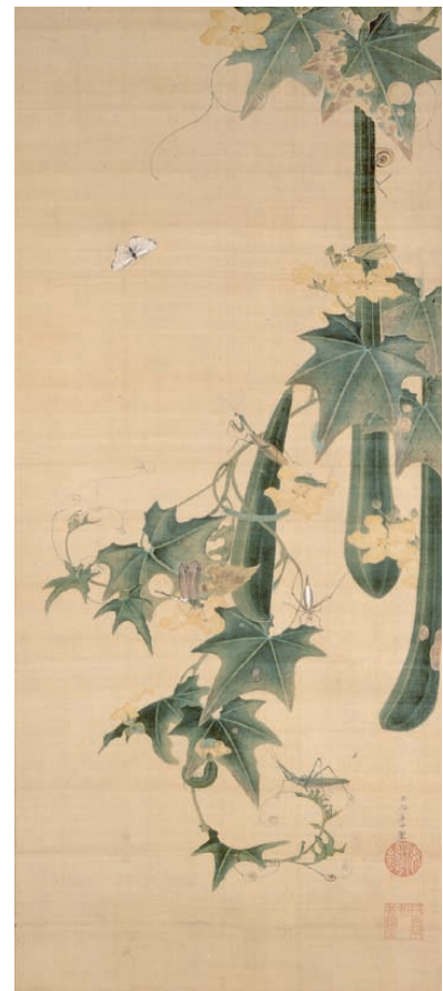
Ito Jakuchu, "Snake-gourds and Insects" Mid-Edo period